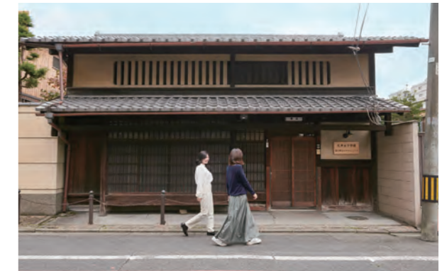
Tominokoji Machiya Campus

At our "Tominokoji Machiya Campus" students can directly experience Kyoto culture. There are also a number of projects in collaboration with Kyoto's shopping streets and tourist associations.